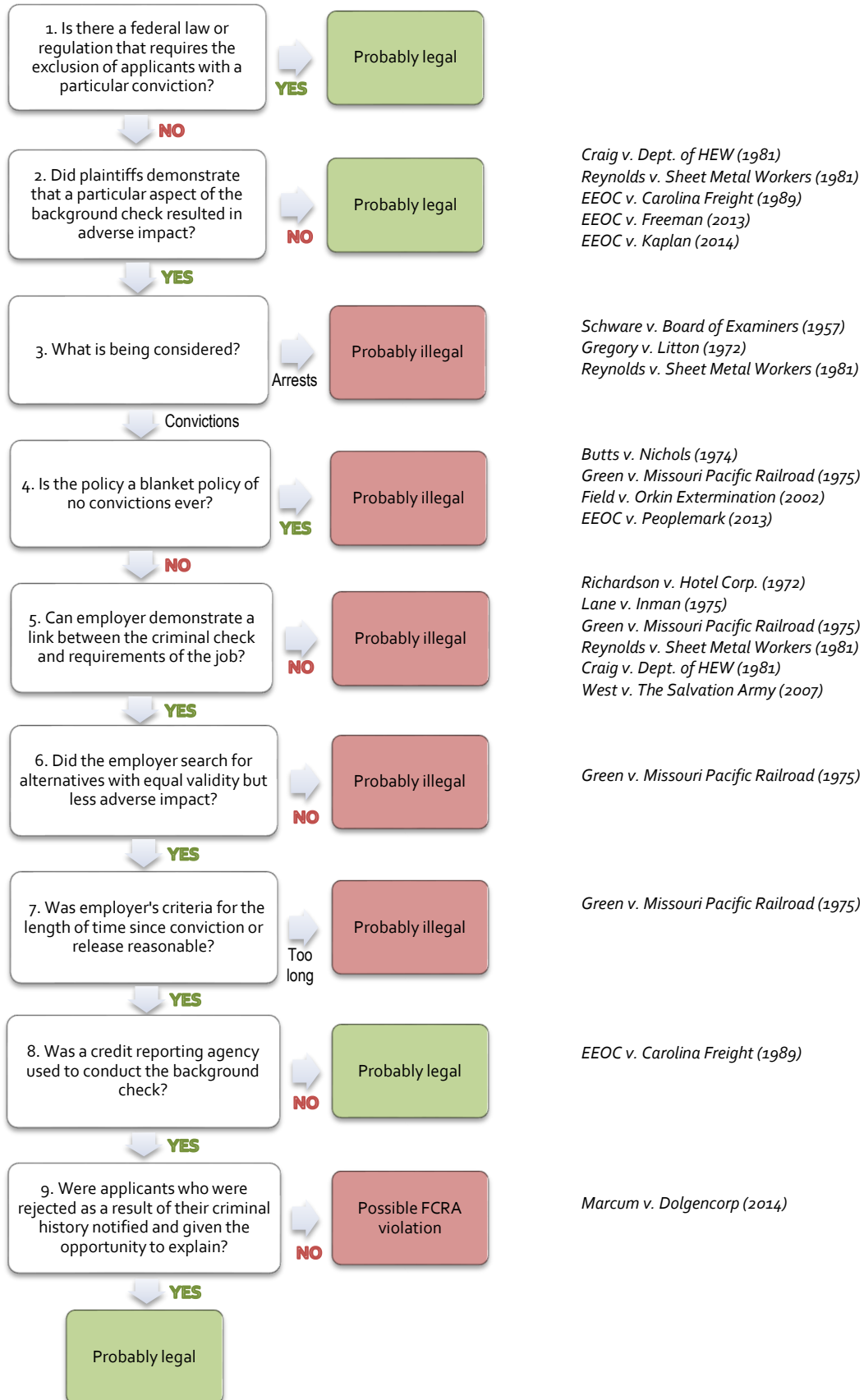
Figure 1. Legality of Background Checks: Flowchart